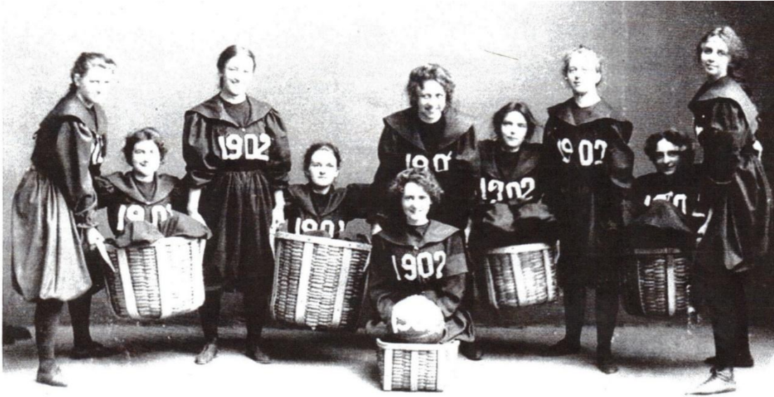
Smith College in 1902 was one of the earliest girls basketball teams

I hope you enjoy the pictures of the early basketball uniforms for girls. Most are from my home county of Montgomery County, Indiana, where basketball really started. Here in Crawfordsville, we firmly believe that the first game of organized basketball was played right here in the old YMCA on March 16, 1894.