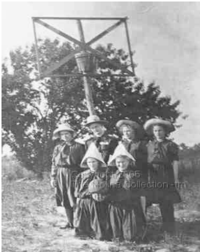
The only picture I have with a real peach basket for a goal