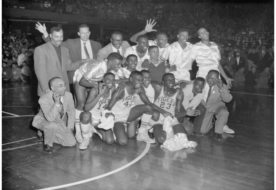
The Crispus Attucks Tigers after they won the Indiana High School Athletic Association

adding, "Educators can use the full set of lessons or select individual ones to complement their curriculum. Ultimately, these lessons are about helping students see how larger social issues