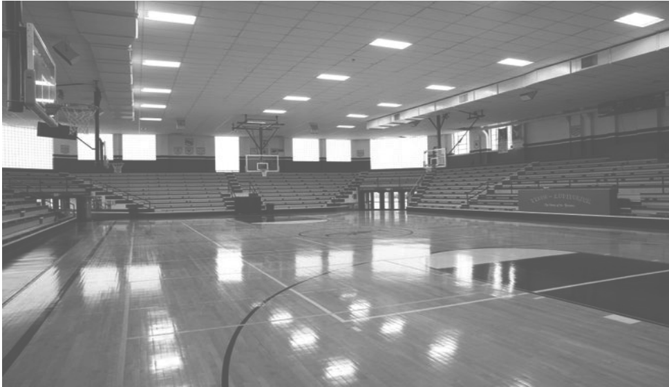
Tyson Auditorium was built in 1950 as the new home for Versailles